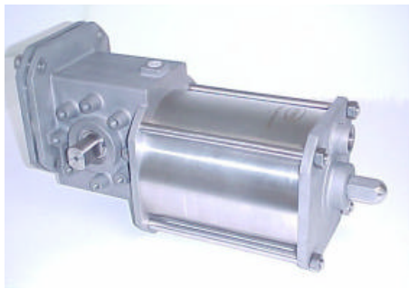
Q07SR80-FA075 with oversized 3/4" NPT air port for rapid exhaust

Speeds of 1/10 second or faster for 90 degree travel.