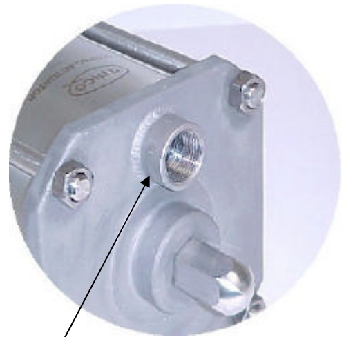
Enlarged Port size = 3/8, 1/2, 3/4 or 1 Inch NPT as required for desired stroke speed